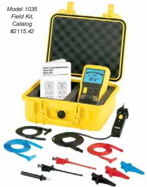
Model 1035 Field Kit, Catalog #2115.42