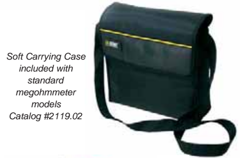
Soft Carrying Case included with standard megohmmeter models Catalog #2119.02