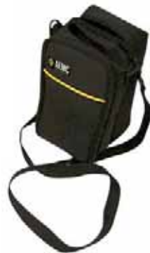
Hands-Free Carrying Case for use with all models Catalog #2118.99