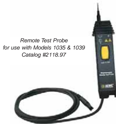
Remote Test Probe for use with Models 1035 & 1039 Catalog #2118.97