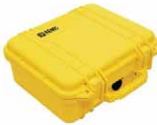
Field Case for use with all models Catalog #2118.98