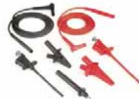
Test Leads for Model 1039 Catalog #2119.40