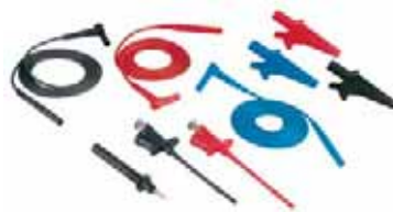
Test Leads for Model 1035 Catalog #2119.41