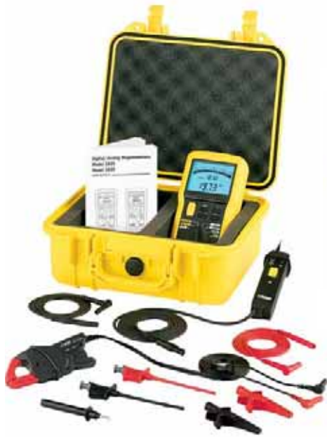
Model 1039 Field Kit, Catalog #2115.43