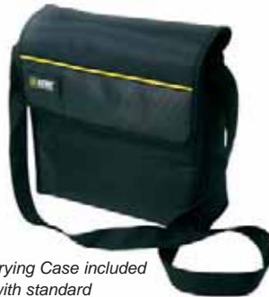
Soft Carrying Case included with standard megohmmeter models Catalog #2119.02