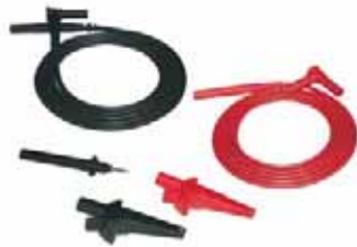
Test Leads standard with all models Catalog #2119.01