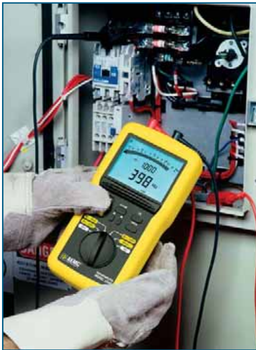
Easy-to-read digital/analog display (backlight on)