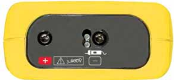
Models 1040 & 1045