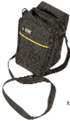
Hands-Free Carrying Case for use with all models Catalog #2118.99