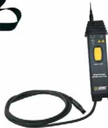
Remote Test Probe for use with Models 1040 & 1045 Catalog #2118.97