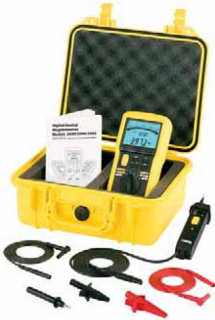
Field Kits Model 1040 Kit, Catalog #2117.30 Model 1045 Kit, Catalog #2117.31