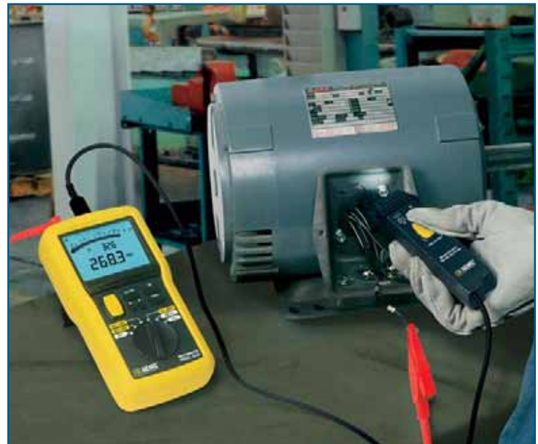
Remote probe used with Model 1045 to initiate a test at the motor. Target light provides good visibility of test area.