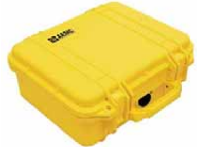
Field Case for use with all models Catalog #2118.98